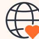
Our World (the communities and systems we serve)

Together, these commitments ensure that every decision we make considers the broader human experience—because at Cariloop, impact isn't a side effort—it's who we are.