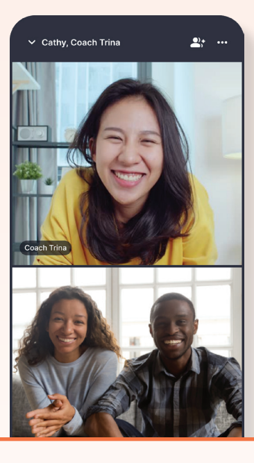
1:1 Personalized Coaching to navigate the complexities of caregiving